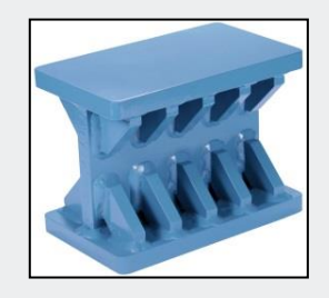
SENSiQ™ Fixed Mount PLUS 10 t ... 330 t BV-D2442

Please contact us for further information on the SENSiQ Secure Mount PLUS and ask for the manual and the detailed planning-in drawings if required.