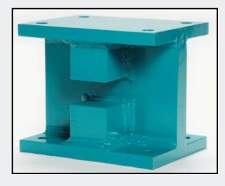
SENSiQ™ Fixed Mount 1 t ... 470 t BV-D2182