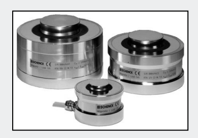
Ring-Torsion Load Cells RTN 1 t ... 470 t BV-D2019